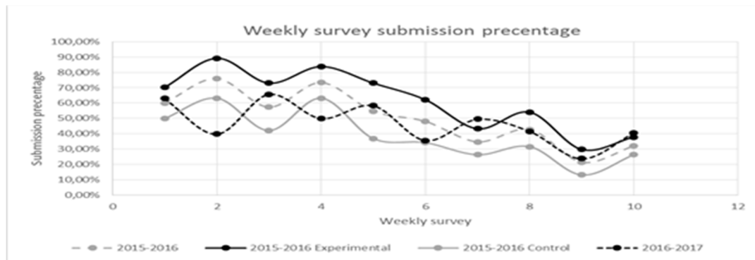
Figure 2. Percentage of weekly survey submission