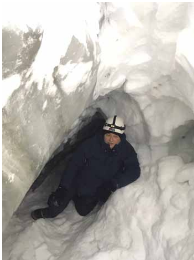
Figure 16. In the depth of glacier at Spitsbergen islands

were working for 10 years on the project BrainNet Europe on the standardization of neuropathological protocols sponsored by Europe Committee. The main purpose was to standardise the method of measuring the shrinkage of the tissue. I personally did not have any financial benefit from this patent.