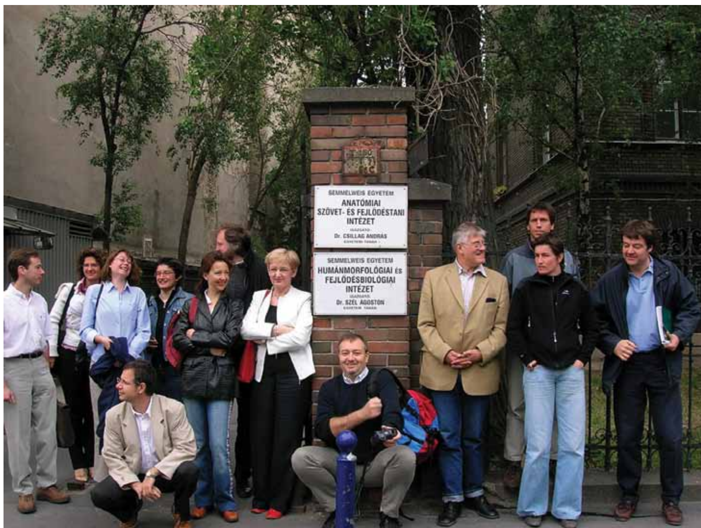
Figure 5. Brain Net Europe meeting in Budapest 2005

I found myself in very uncomfortable situation, but I said to myself to try to use the trick which did work on the end of the day. I had approached to Kostović and said that Knežević is very interested in the conference and that we have a unique opportunity for brainstorming between scientists in these two areas of neuroscience. The same arguments I presented to Knežević, and finally they both agreed and the conference took place in Dubrovnik 1990. I was so happy that I decided to do my best to have the conference succeed.