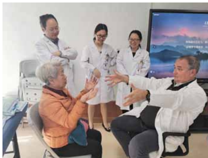
Figure 18. Patient in China 2019