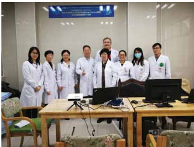
Figure 17. At neurology clinic in China Shenzhen 2019