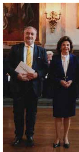
Figure 19. With Queen Silvia at the grant award ceremony 2023.

My advice is to master certain techniques and skills while you are still in Croatia. Also try to establish contacts with colleagues from other parts of the world by publishing in international journals, attending congresses, making poster presentations, using different EU programs for student exchange, define you research interest together with mentor, get a PhD or post-doc position in Croatia or abroad. If you go abroad try to come back to Croatia and build up scientific infrastructure and initiate the national and international projects helping country to enter international family of scientist and putting Croatia higher at the scientific map. That privilege to be accepted back in the country of origin is the most valuable step in forming the new scientific environment and usually it is highly appreciated. I deeply regret that I did not get an offer and chance to come back earlier and share my experience with experts in Croatia.