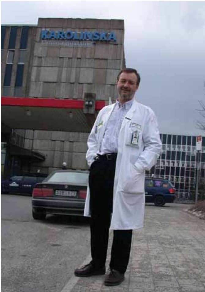
Figure 9. In front of Karolinska Hospital 2006

fixation and tissue preparation is crucial for immunostaining. I decided to do everything by myself hoping that I will get a result. It was a very stressful moment but I was highly motivated to succeed. At the end I managed to complete the immunostaining. I was so overwhelmed with emotions that I started to cry in my small room, but then I pulled myself together, and then came out and showed the results to the rest of my group. I knew that I am going to change my position in the group and from a visitor become a respectful and fully accepted member. After that I did have much more freedom especially after the missteps in the immunostaining protocol had been changed. That technician responsible for the immunostaining was later included in my own group and today we are best professional colleagues. For me this event showed how important it is bring knowledge and useful working skills from your native country, especially if you have skills that the host may not have.