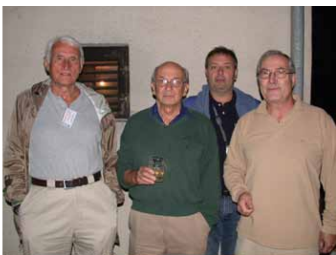
Figure 7. Krnjevic, Rakic, Kostovic, giants of Croatian neuroscience, Zadar 2005