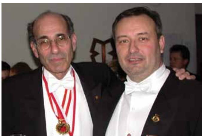
Figure 3. 2004 with Nobel laureate in medicine Richard Axel Columbia NY