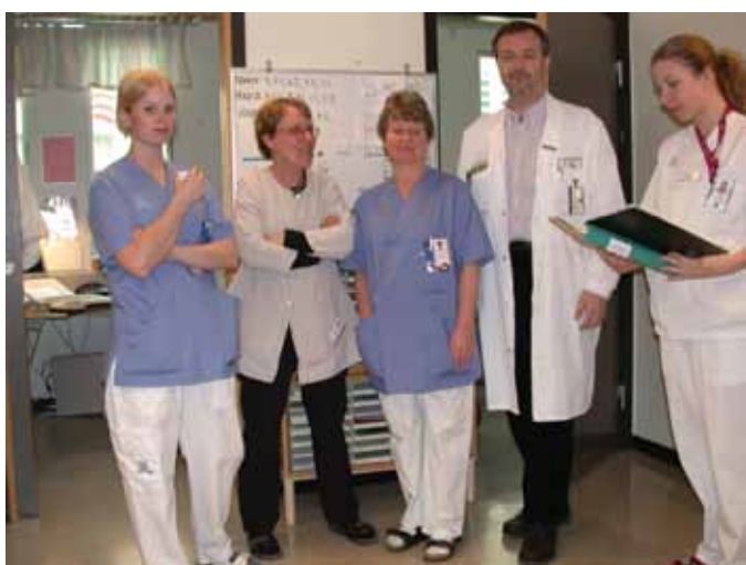
Figure 8. At my clinical department 2006

that moment it was a survival move. The major difficulties were to leave my parents and my sister, Zagreb as a my town, friends and colleagues, almost my entire life behind. I was not worried about work in Sweden, I already had a project and scientific tasks but the environment all around us was totally new for me and my family