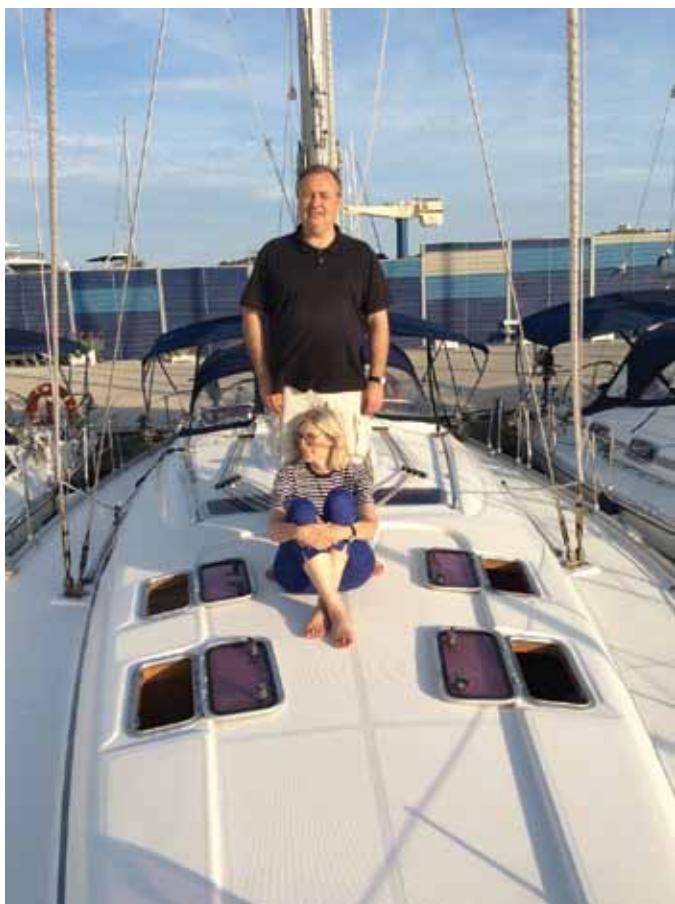
Figure 15. With my wife at the summer holidays 2015