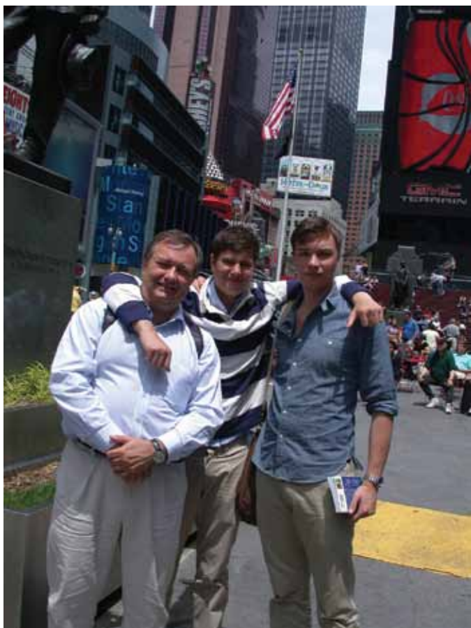
Figure 14. With my sons in Big Apple where I had a company HQ 2011

of antibodies currently registered this January by FDA. APOE lipoprotein, is coded by a gene that is one of the greatest risk genes for the Alzheimer disease in the elderly. In our Nature paper ( Nature Medicine , 4:1182-4, 1998) we have stressed how APOE is involved in other diseases like HIV, as a contributing factor for cognitive impairment. My work on Swedish mutation and APOE has shown that gene to gene interaction can shape the clinical and morphological features even in mutation brains as mentioned earlier. Some of pioneer work I did on cholesterol function in the Alzheimer disease brain where astrocytes seem to be mostly involved ( Neurosci Lett. 13:314(1-2):45-48, 2001). Other pioneering work was done showing the difference in intraneuronal amyloid concentration among the Alzheimer brain neurons regardless of mutation or idiopathic cause of the disease ( Neuroreport. 2008, Jul 16;19(11):1085). At the clinical side of my research, I was always interested with the unusual clinical features and possibilities to test those differences, thus non-classical clinical presentation of the Fronto temporal Lobe dementias ( Neuropathology. 2011 Jun;31(3):271-9, AJNR Am J Neuroradiol. 2009;30(6):1233-9), speech disorders and