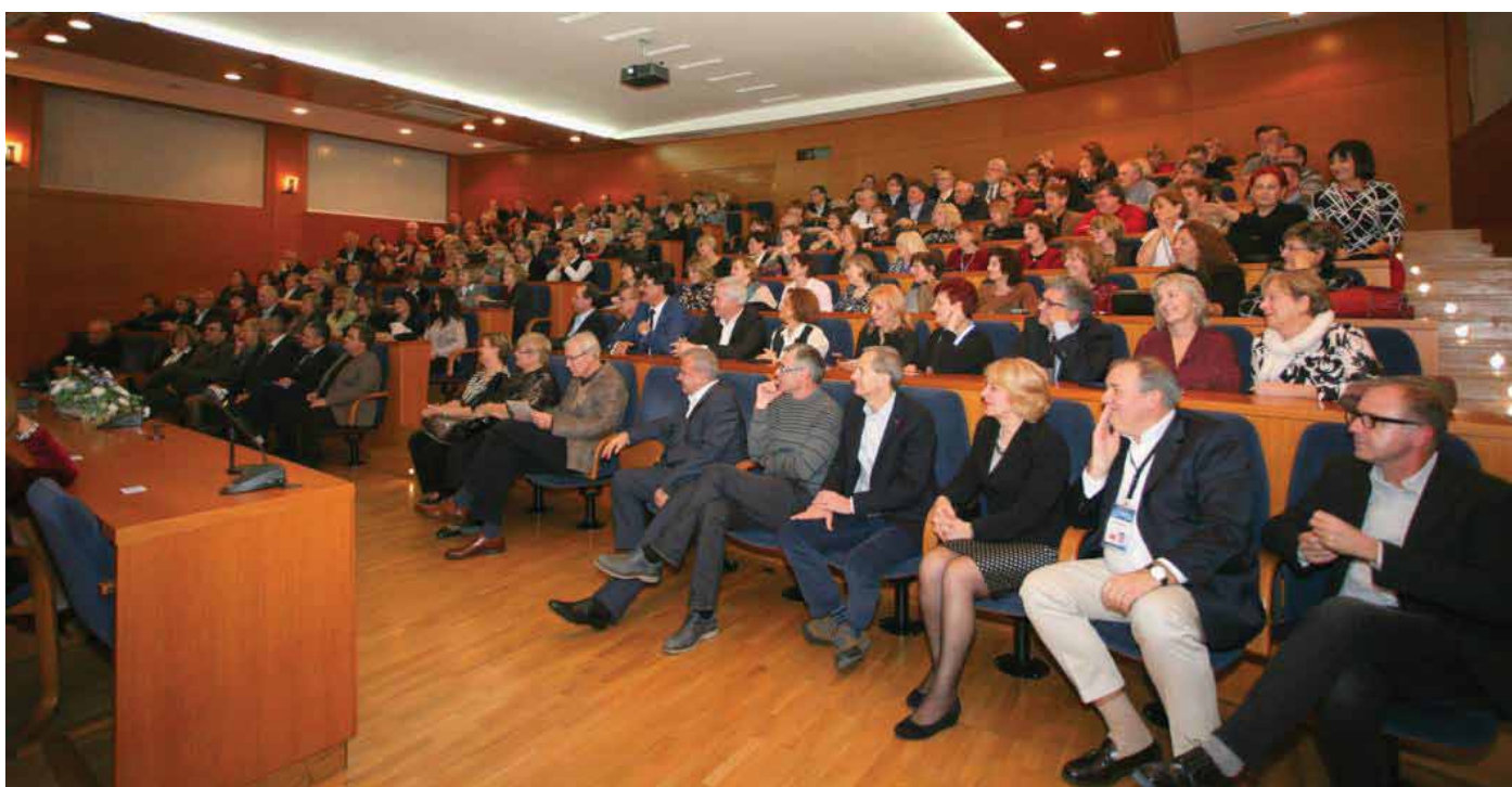
Figure 1. 40 years of generation, Zagreb, The Croatian Medical Association, 1976

Following the example of my parents I refused to be part of any group, political or religious or any other, or to yield to the pressure of such groups. Like my parents I have been trying to be progressive, to have empathy towards others irrespective of their background or origin. I was always impressed by those whose actions were based on knowledge and honesty, and had inherent personal values. That was and still is my modus vivendi .