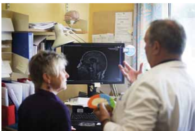
Figure 12. Explaining the brain to the patient, 2016 Oslo