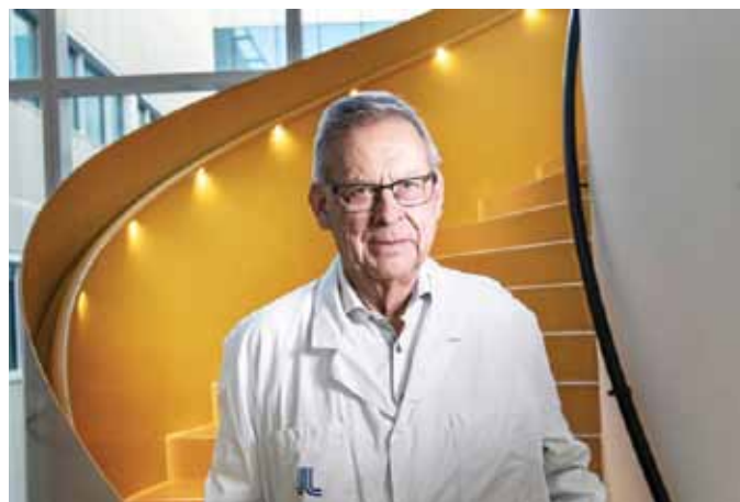
Figure 4. Professor Bengt Winblad