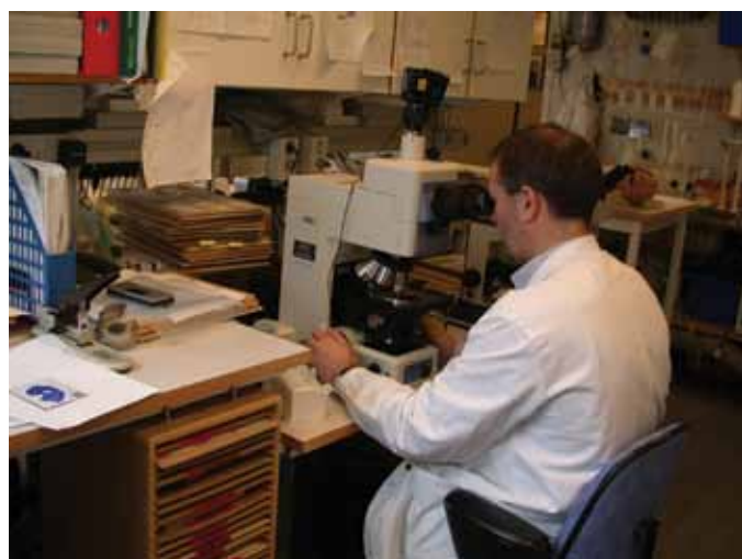
Figure 2. With NIKON microscope, I did have the most advanced one, 2001

One of the main goals of our student organization was to produce teaching material in form of transcripts of lectures for those subjects where our professors were not able or not willing to write a textbook, or translate a text from a foreign language. The typical example was pathophysiology where we did not have any official literature but rather machine written short texts that was provided after we have heard each lecture. We were working day and night to get enough copies for the entire class using two Gestetners mimeographs which used to be always out of function after a few hours of printing. The copy machines were the accessible in the main administration offices but could not be used by us students. The second important activity was improvement of teaching and education via a student teaching committee led by us and Dr. Branko Richter, the Professor of parasitology. His contribution to our studies during the first 3-4 years was immeasurable.