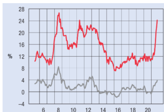
Figure 4. Perceived and realized inflation rate comparison in Croatia, 2021, % change

Lastly, a glimpse at inflation perception will also be given in order to disseminate all the previously showcased data. According to HNB (2021), based on a sample of 1000 monthly participants and using a questionnaire method testing the participants' perception of price levels of certain categories of goods and services, the perception of inflation was considerably higher than the real inflation rate in the country. For the year 2021, the perceived inflation rose a little higher than 24%, with the real inflation being a mere 3,8%, concluding that the consumers' and investors' sentiments are quite pessimistic and rooted in fear of high prices. Also, said prices are perceived as even higher than they really are, thus additionally adding to the fact that the Croatian living standard may be significantly hindered when looking at the weak ratio between inflation and wage growth rates. People tend to think inflation is much higher than it is, possibly feeling as though their existing consumer and investor powers are worsening every month. There is no data available that is more recent, but it is safe to assume, considering all what was shown, that the above sentiment still remains, if not being additionally intensified with high inflation news across the globe. Figure 4 shows the comparison between perceived and real inflation rates, with the red line presenting perceived and the grey line presenting real inflation.