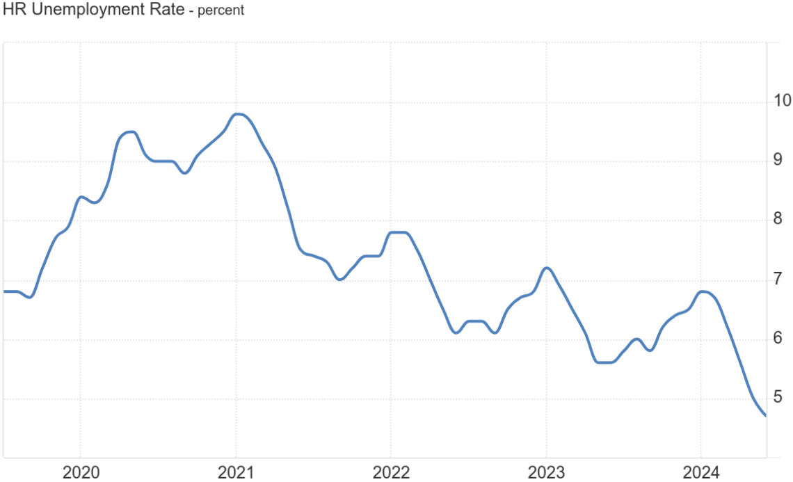
Figure 5. Croatia's unemployment rate