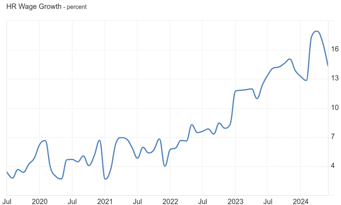
Figure 2. Wage Growth in percentage