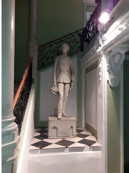
12 Pietro Stefanutti, Statue of Franz Joseph I from the Rijeka memorial fountain, 1857. State Archives in Rijeka

[38] At the time this monument was built, Rijeka was under the administration of Croatia proper. With the 1868 Croatian-Hungarian Settlement, the city became a Corpus separatum , separate from the Croatian territory and directly subordinate to Hungary. It seems likely that it was these political changes that led to the removal of the memorial fountain. As early as 1874, the city government decided to relocate the fountain justifying the decision in terms of easing the flow of traffic, but neither the fountain nor the statue of the emperor was ever re-erected at a different location. The reason for removing the fountain was probably the Austrian imperial coat of arms that stood on it, which for many was a symbol of the centralist and absolutist policies of Alexander von Bach who headed the government at the time. The removal can thus be interpreted as a sign of a strong anti-Viennese sentiment in the city, fuelled by Hungarian nationalism. This act, however, ensured the preservation of the monument, which has been given a place on the staircase of the Rijeka State Archives. 57