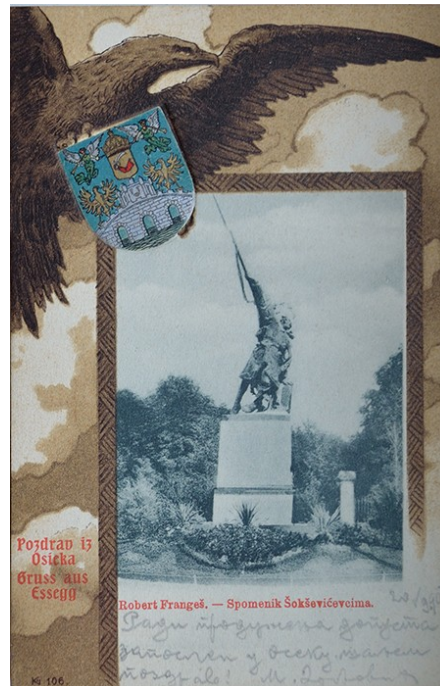
3 Robert Frangeš Mihanović, Monument to the Heroes of the 78th Home Guard Osijek Regiment, so-called Šokčević's Monument, Osijek, 1897–1898, postcard, early 20th century. Museum of the Serbian Orthodox Church in Belgrade, Radoslav Grujić Estate

the figure of a warrior dressed in the uniform of said regiment, which fought on the battlefields of Bohemia in the Austro-Prussian War in 1866.