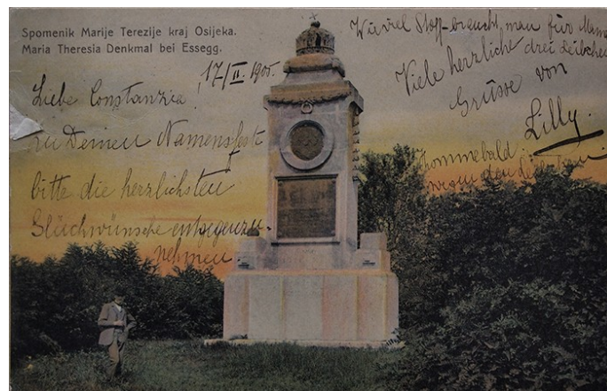
5 Monument to Maria Theresia and Joseph II, erected in Osijek in 1779, postcard. State Archives in Osijek, collection of postcards