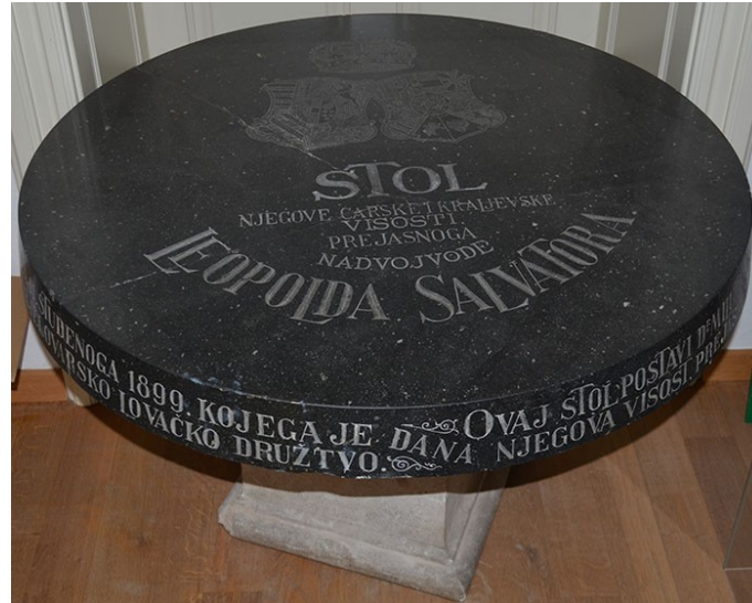
16 Memorial table built in 1903 in the Jasik Forest near Bjelovar, commemorating the pheasant hunt of Archduke Leopold Salvator in this forest in 1899. Bjelovar City Museum, Cultural-Historical Department, Collection of Furnishing, Inv.-Nr 1608