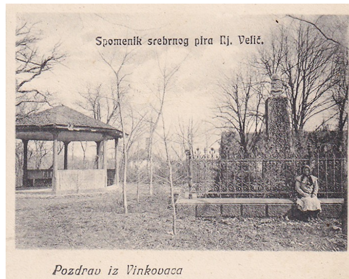
7 Monument to the Silver Wedding Anniversary of Emperor Franz Joseph I and Elisabeth, Vinkovci, 1879, undated postcard. City Museum, Vinkovci, Collection of Postcards, Old Photos and Drawings P3125

It seems that the original site of the monument was chosen to mark the border between the Triune Kingdom of Croatia, Slavonia and Dalmatia and the Military Frontier, and to stress the fact that both of these provinces were loyal to the emperor. The monument was later moved closer to the centre of Vinkovci, to a park called Lenije. 36 It was a truncated obelisk in shape. As this paper shows, many monuments erected in Croatia in the nineteenth and early twentieth centuries took the form of an obelisk, which probably reflects the practice in the central regions of Austria-Hungary, in which numerous monuments of this kind were erected (e.g., so-called Austrian Monument in Kulm [1825], Adalbert Stifter Monument above Lake Plöckenstein/Plešné [1876/77], the Emperor's Obelisk on the Stilfserjoch/Stelvio Pass between South Tyrol and Lombardy [1888], Liebenberg Monument [1887–1890] and Hesser Monument [1909] in Vienna, etc.). The coat of arms of the Triune Kingdom stood on top of the Vinkovci obelisk, and above it the Hungarian crown. Today the coat of arms (but without the Hungarian crown) is the only surviving remnant of the monument (together with some pieces of stone standing on the site of the monument), while the rest was destroyed in 1918. 37