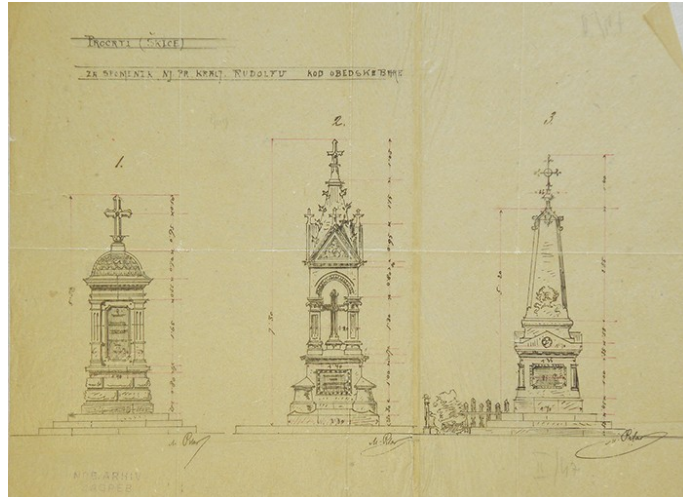
15 Martin Pilar, design for the Prince Rudolf monument near Kupinovo, 1889. Archiepiscopal Archive, Zagreb, Collection of Architectural Designs, sign. II-47

The Petrovaradin Property Management Authority opted for the third version. As the monument was destroyed during the Second World War, we have to rely for information about its appearance, apart from what the preserved design drawings offer, on the illustration of the monument made by the famous Croatian painter Celestin Medović for the volume of Die Österreichisch-ungarische Monarchie in Wort und Bild dedicated to Croatia. 74