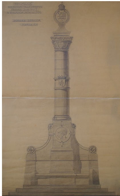
13 Herman Bollé, design for a monument to Franz Joseph I in Donji Miholjac, 1902. Croatian State Archives, Zagreb, Collection of Building Documentation, sign. XXXIII-1

monument. The design of the memorial was initially entrusted to Zagreb architect Herman(n) Bollé (1845–1926), a former student and long-term associate of Friedrich von Schmidt. 59 By that time Bollé had already realized a number of memorials, such as the above-mentioned Cross of Eugene of Savoy at Petrovaradin or the monument dedicated to the first visit by Franz Joseph I to Bosnia and Herzegovina (1885) which was erected in Bosanski Brod in 1887. 60 Bollé's design for Donji Miholjac envisaged a columnar monument standing on a tall, square pedestal. An oval at the top was to contain the coat of arms of the Triune Kingdom with the crown of St. Stephen, while the pedestal was to display a medallion with the emperor's portrait in low relief and Virovitica County's coat of arms in the middle (Fig. 13).