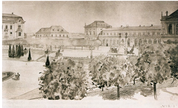
9 Viktor Kovačić, (unexecuted) design for Franz Joseph I Square in Zagreb with a monument dedicated to the emperor, 1904–1905. Ministry of Culture of the Republic of Croatia, Zagreb, Collection of Architectural Designs

Railway Station, and on the north by the Art Pavilion. After years of planning the layout of the square, the city government finally launched an architectural design competition in 1905. The competition was won by the Zagreb architect Viktor Kovačić (1874–1924), a student of Otto Wagner, who, in addition to the proposed urban development of the square and the construction of a flight of steps on the square, also envisaged a monument to the emperor, to be erected on the south side, facing the Main Railway Station. While the sketches for the monument have been preserved (Fig. 9), a description has not survived, so its iconographic program is unknown.