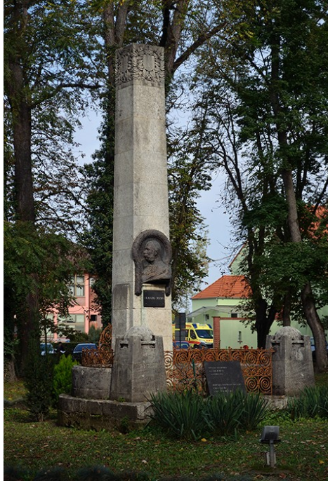
14 Robert Frangeš Mihanović, Monument to Franz Joseph I in Donji Miholjac, 1905

Vrapče near Zagreb, bearing a portrait of the emperor executed in bronze. 64 It was topped by a coat of arms, most likely of the Triune Kingdom or Virovitica County, which was later removed. The monument is surrounded by a fence and four pillars whose form evokes those on the Secession building in Vienna (Fig. 14).