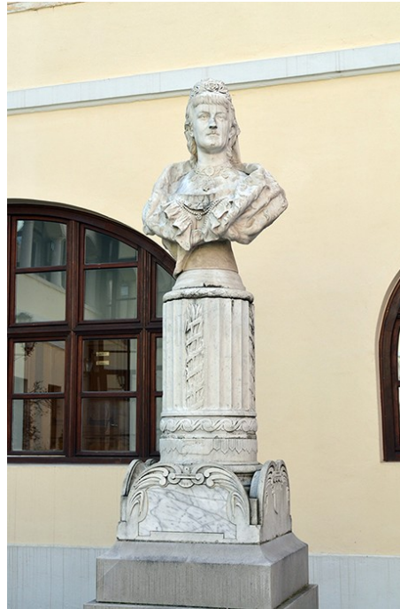
11 Ivan Rendić, Monument to Empress Elisabeth , Varaždin, 1898–1900

Its design was entrusted to Rendić, who made the first sketches for it in 1898 and completed it in 1899–1900. 49 After the dissolution of the Monarchy, the monument was damaged and removed, but not destroyed. It was first moved to the Varaždin theatre and then to the City Museum, and was later re-erected in the courtyard of the Varaždin County building, where it stands today. In addition to the memorial in Donji Miholjac, which will be discussed below, the Varaždin memorial represents a rare example of a monument to the Habsburgs in Croatia that underwent restoration (although in this case the monument was not reinstalled in its original location). 50