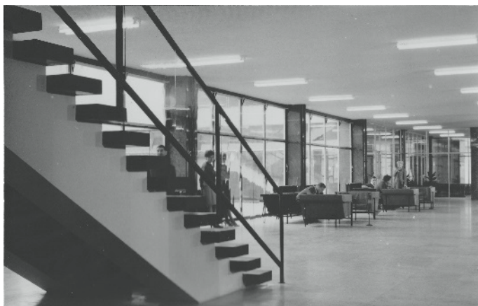
Figure 6. Interior of Moša Pijade Workers' University in Zagreb (1961), corridors with the “islands for rest”.

The total surface of 20,000 m 2 was designed as a small city for around 5,000 daily visitors. Within the complex, spaces include inner streets and squares, open inner courtyards, halls and classrooms. Each space is given its own specific meaning by its position, use and fittings, but above all by its relationship to other spaces, to the whole and to the content of the site. The corridors, pathways and foyers play a key role as multifunctional spaces for communication. Special attention was paid to the “islands for rest” that were carefully distributed throughout the building (Figure 6). The purpose of shaping transparent spaces was to achieve an atmosphere and emotional quality whereby workers and visitors could feel “at home”. Nikšić defined the main idea of architectural design as a space–time concept, undoubtedly evoking Siegfried Giedion’s theory set forth in his influential book Space, Time, Architecture , first published in 1941 (Nikšić 1958). The spaces were vertically connected with several freely situated stairways, forming a “continuous” floating space.