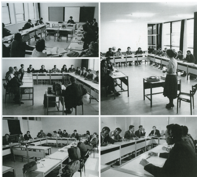
Figure 9. Interior of Moša Pijade Workers' University in Zagreb (1961), spatial module — a seminar room with desks that could be easily moved around to accommodate different teaching methods.