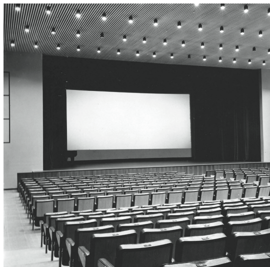
Figure 8. Interior of Moša Pijade Workers' University in Zagreb (1961), Great Hall.

An optimal space was created through a study of teaching methods: a “seminar” unit for a group of 15–20 participants. Instead of rigid classrooms, the interiors were designed according to individualised and dynamic teaching methods and programmes and fitted with modular furniture and fittings that could be arranged in various combinations, which enabled direct and more democratic communication within a group (Figure 9). Thus teaching models and educational programming generated the building's spatial structure based on a spatial module of 7x7 metres.