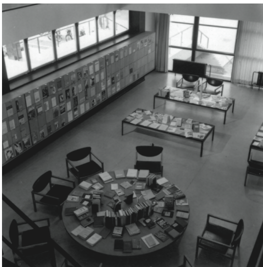
Figure 7. Interior of Moša Pijade Workers' University in Zagreb (1961), Bernardo Bernardi, round table and A4 chairs in the ground floor reading room (source: Library of the Public Open University Zagreb, photo: Željko Krčadinac).

accordance with what the space would be used for). According to the principle of synthesis, Bernardo Bernardi designed all of the interior fittings, which created an organic whole of highly individualized spaces that could be easily modified. In addition to the educational units, the space included a large library with a reading room and a documentation centre (Figure 7), editorial offices for ambitious publishing activities with printing facilities and numerous additional activities. Special attention was paid to the design of the two multifunctional auditoriums, one with 600 seats (Figure 8) and the other with 220, planned for conferences, concerts, theatrical performances and film screenings. The cultural education programmes were particularly interesting and ranged from introductory to more advanced courses. The visual arts syllabi focused on understanding and experiencing art and included art history, modern and contemporary art, and architecture and design.