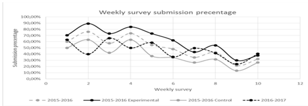
Figure 2. Percentage of weekly survey submission