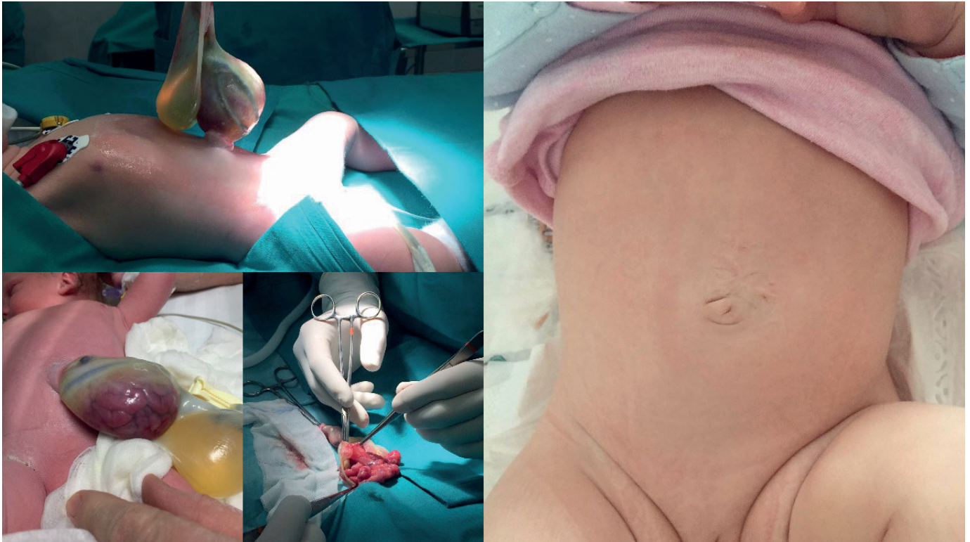
Fig. 1: Umbilical cord hernia.