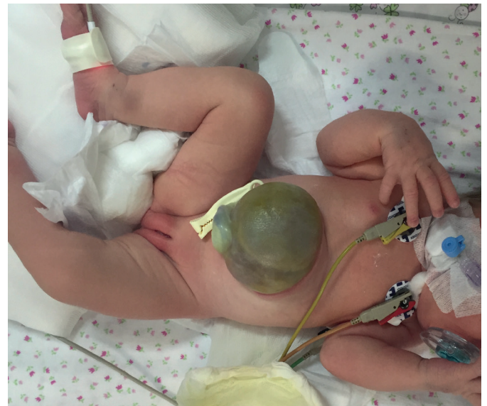
Fig. 3: Omphalocele.

of both the small and the large intestine and rarely the liver and the gallbladder. Associated anomalies and chromosomal aberrations happen rarely, as shown by Haas et al, who described a series of 7 newborns with umbilical cord hernia whose amniocentesis had normal karyotype, as in our case (2, 3).