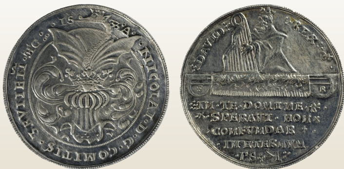
Tallies of Zrinski / taliri Zrinskih—Arheological museum in Zagreb / Arheološki Muzej u Zagrebu, inv. E21714

Due to the threat of the Ottoman Empire, Zrinski built the fortress of Gvozdansko in 1488. Around 1524, a mint was established, and silver coins were made. In addition, there were a smelter and foundry, which made it possible to make beautiful pennies, groshes, and tallies with various engravings (mostly coats of arms, characters, and initials - from those of mine owners to the initials of the mould cutter).