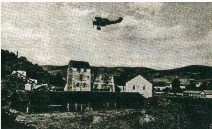
Blast furnace in Bešlinec / Visoka peč u Bešlincu, 1935 (from [4])