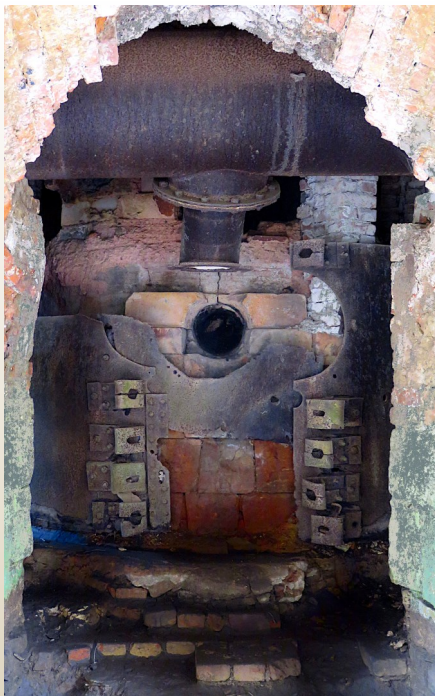
Remains of blast furnace in Bešlinec / Ostaci visoke peći u Bešlincu, (References, notes / Reference, napomene)