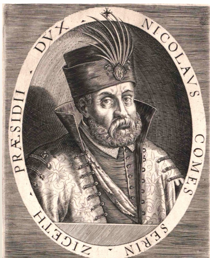
Nikola IV. Zrinski Sigetski (Available at: https://matica.hr/hr/530/nikola-iv-subic-zrinski-27448/ , accessed 12.2.2020)

In 1540, 1574 and 1576, Gvozdansko was under attack