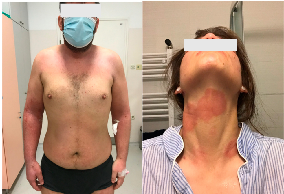
Figure 1. Clinical pictures of the patients with atopic dermatitis.

The prevalence of AD has doubled or tripled over the last 30 years in industrialized countries. It is estimated that 15% to 30% of children, and 2% to 10% of adults, are affected [4–7]. AD typically occurs in the first year of life (in about 60% of cases) but may appear at any age, and its complete remission has been observed in 70% of children before adolescence. Early onset of the disease, familial associations, and early allergen hypersensitivity are all risk factors for a prolonged disease course and persistence into adulthood [8,9].