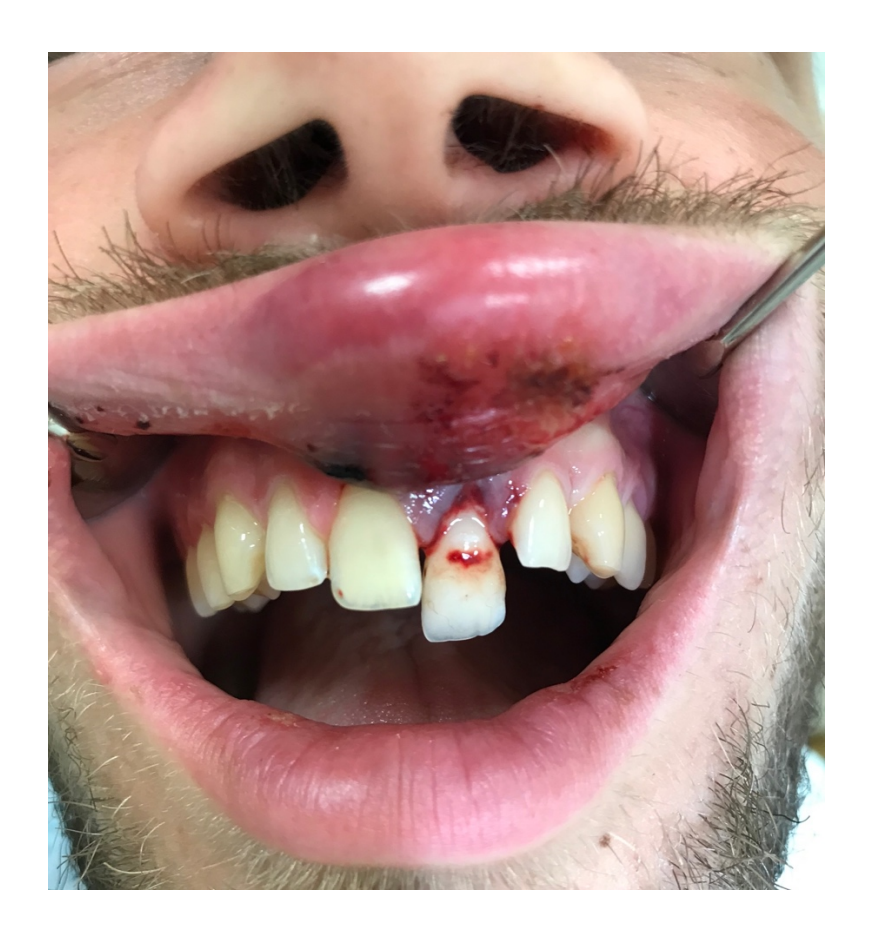
Picture 3. Tooth 21 is visibly mobile, nearly dislodged from the alveolar socket, with evident bleeding and significant swelling of the upper lip. Minor incisal edge fracture of tooth 22 visible.