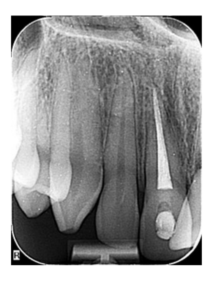
Picture 6. Radiograph displaying teeth 11, 12, 13, and 14. None of these teeth were affected by the trauma.

Initially, tooth 21 was extracted, followed by the immediate placement of a provisional restoration (Picture 7. and Picture 8.). In order to better accept the effect of tooth loss, the patient's own tooth 21 was used as a provisional after extraction. Moreover, the purpose of the bonded natural tooth pontic lies in protecting the extraction area and serving as an ovate pontic contact surface. Compared to an acrylic or composite tooth the natural tooth is the optimal pontic in terms of color, shape, size, alignment, and adhesion. For stabilization, a periodontal splint was placed on the palatal aspect of the tooth.