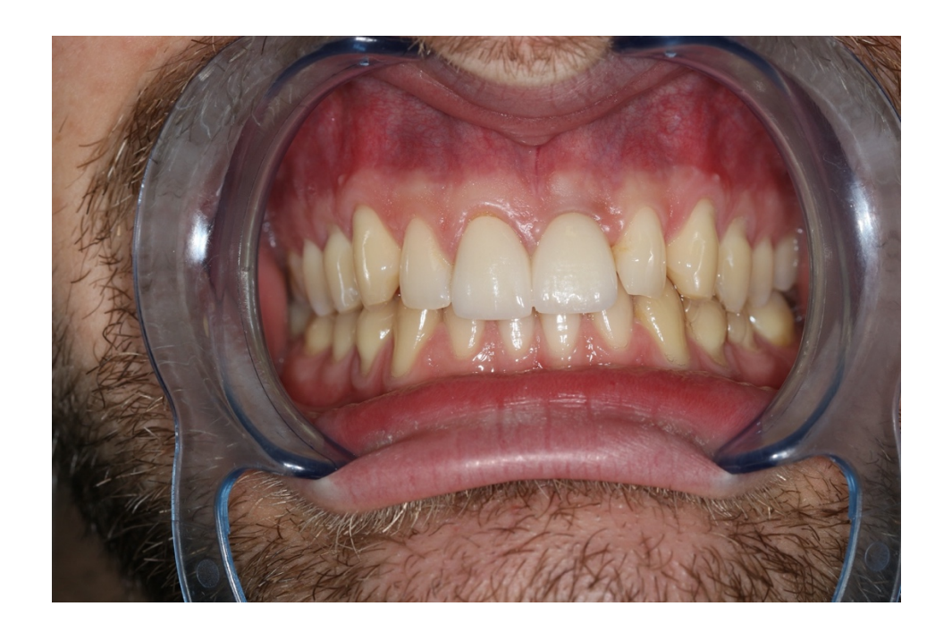
Picture 13. Image from the latest check-up, four years after treatment, showing satisfactory outcomes with the exception of a slightly noticeable gingival recession around crown 11 (January 2024).