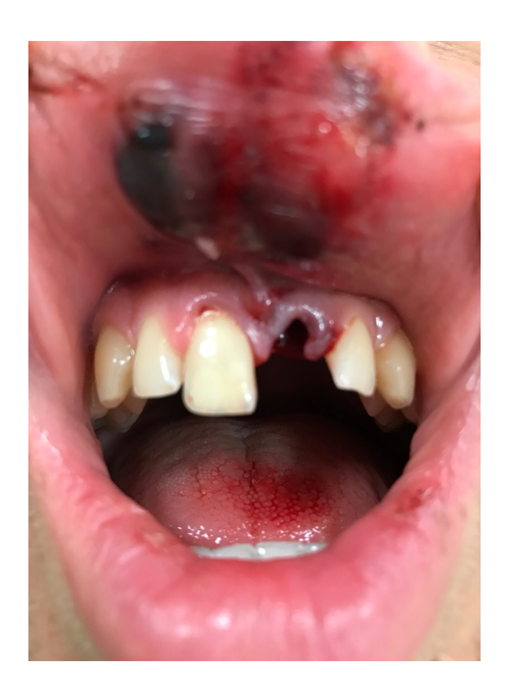
Picture 7. Extraction of the fractured tooth 21 after the trauma (24<sup>th</sup> of August 2019). Due to the condition of the bone immediate implantation after extraction was not possible.

Subsequently, implant therapy was performed to replace tooth 21, followed by the placement of a crown on the implant site (Picture 9. to Picture 12.).