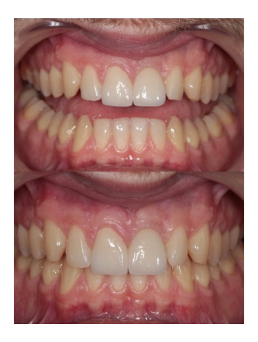
Picture 11. Image illustrating the completed crowns on the implant site (Emax crown) and on tooth 11 (metal-ceramic crown), which had undergone endodontic therapy prior to the trauma (04<sup>th</sup> of January 2020).

Due to aesthetic reasons, a crown was placed on tooth 11, which had undergone endodontic treatment prior to the sports-related trauma. Furthermore, the fracture of the left lateral incisor was restored using composite material (Picture 11. and Picture 12.).