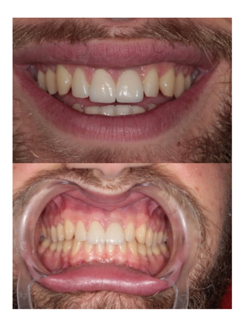
Picture 12. Besides the placement of the two crowns on the central incisors, a composite restoration of the fractured incisal edge on tooth 22 was performed.

After a four-year follow-up, the patient came for a check-up, and a new photograph was taken. The outcomes presented were completely satisfactory (Picture 13.). The successful therapy described in this case report allows the young patient to continue his physical and psychological development without compromising his self-confidence during adulthood.