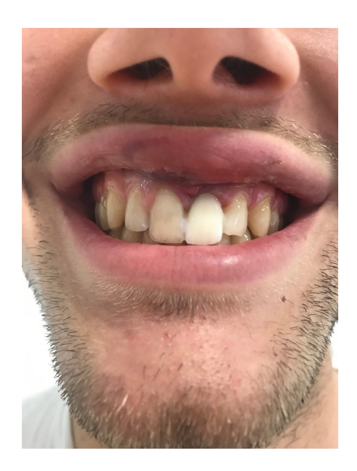
Picture 8. Placement of the patient's original tooth 21 as an immediate provisional after extraction. Typically, there is a noticeable change in color of tooth 21 after extraction.