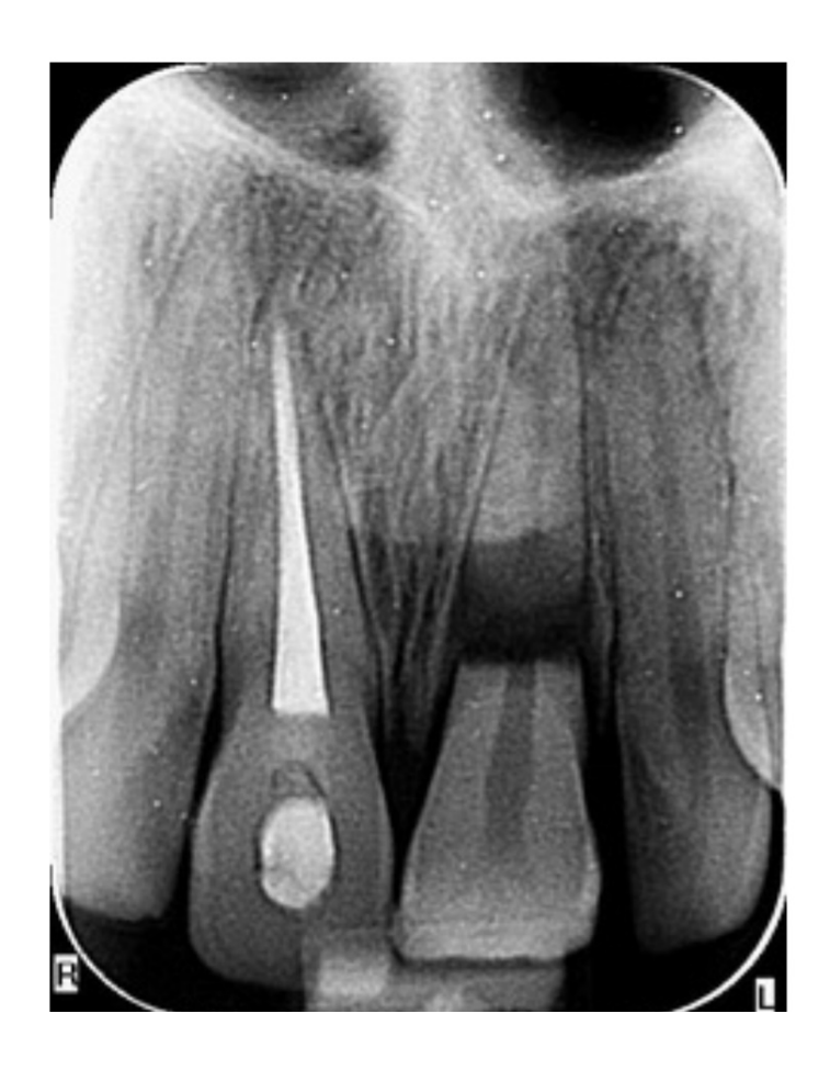
Picture 4. Radiograph illustrating teeth 12, 11, 21, and 22. An immediate X-ray image taken right after the incident shows a horizontal fracture in the middle of the tooth 21. Tooth 11 exhibits successful endodontic treatment completed before the trauma occurred.