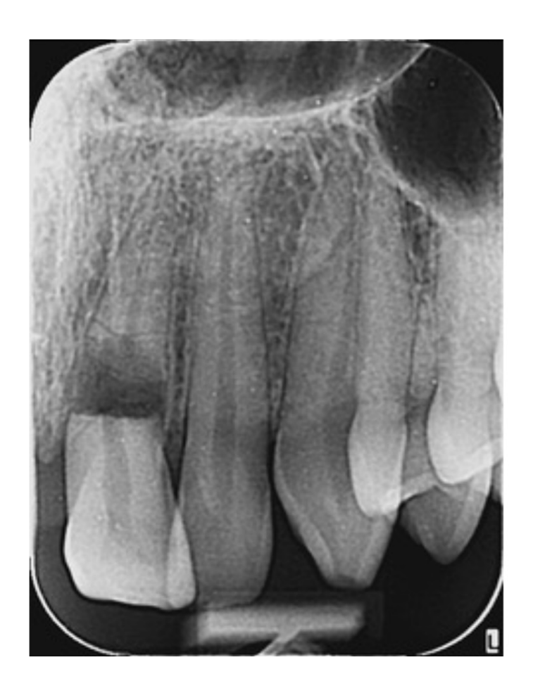
Picture 5. Radiograph revealing teeth 21, 22, and 23. The radiographic image clearly depicts the horizontal fracture in the middle of tooth 21.