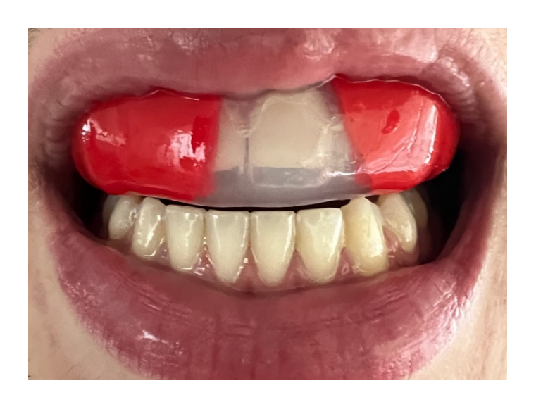
Picture 1. Mouthguard inside the oral cavity of an ice hockey player

An ideal mouthguard should exhibit qualities of protectiveness, comfort, durability, resistance to tears, freedom from odors and tastes, affordability, simplicity of manufacture, and minimal interference with speech (4).