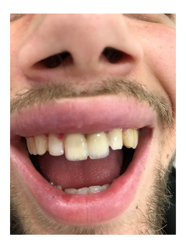
Picture 10. The provisional restoration after implant placement permits the patient to function normally in terms of speech, mastication, and psychological well-being.