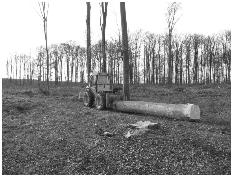
Fig. 2. Ecotrac 55V skidder in regeneration cut.

(2000) and Klvac et al. (2012). The emission factors for the lubricant were selected on the basis of oil types, i.e., fully mineral gear oils, semi-synthetic engine oil, with an 80:20 ratio, and mineral lubricants. The fuel and oil consumptions were determined on the basis of nominal engine power, engine load factor, engine specific fuel consumption, and time of use per output unit, as reported in Picchio et al. (2009).