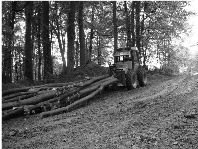
Fig. 1. Ecotrac 55V skidder in thinning.